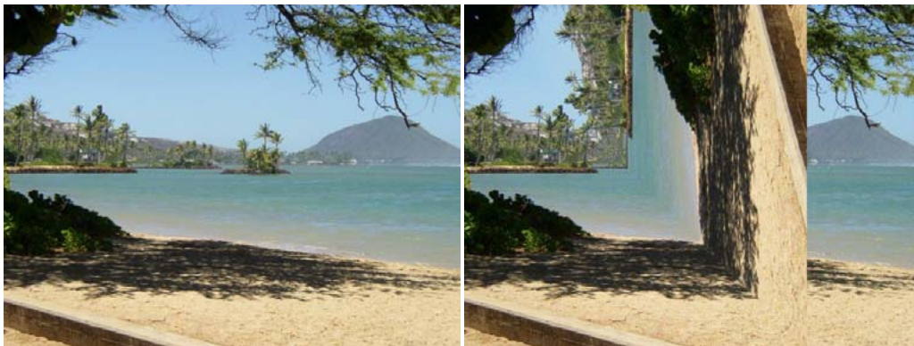
Figure 9: Original picture (left) and mirrored around the diagonal line with copying from bottom left to top right (right)