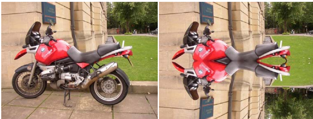
Figure 8: Original picture (left) and mirrored from top to bottom (right)